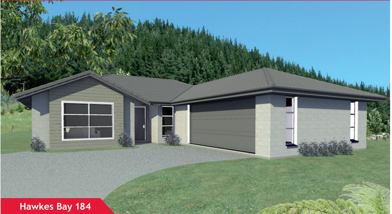
Hawkes Bay 184